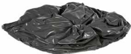
JAY ® Cryo ™ Insert